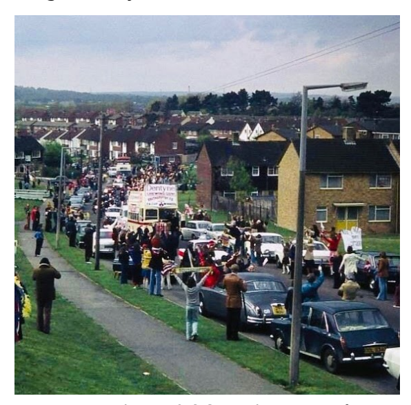
Meggeson Avenue 1976. Saints FA cup win parade. Marlhill Copse on horizon

8. Page 5 para 8: "There are few locations which provide any direct views of the five trees identified for felling." Simply wrong . The trees can be seen easily from The hill to the east of Hatch Grange (West end) \sim 1.5 km, Copsewood Road (next to Bitterne Park school) \sim 1 km and (in winter) the Itchen Valley Country Park (near the Fareham/Eastleigh railway line \sim 2 km). As the pines are evergreen they are even more visible in winter.