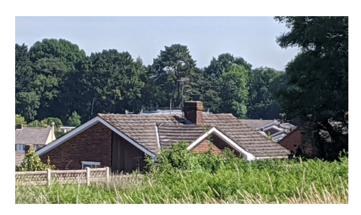
T119 (centre) from Frog's Copse ~0.5 km. June 2020