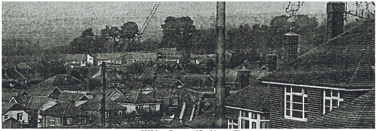
2003 from Copsewood Road (next to Bitterne Park School)